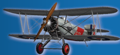
Aircrafts Created Using FS Design Studio v2

FS Design Studio V2 is now more powerful, too. It adds the latest visual techniques and graphic effects to an already large set of commands, timesaving shortcuts and comfortable user interface.